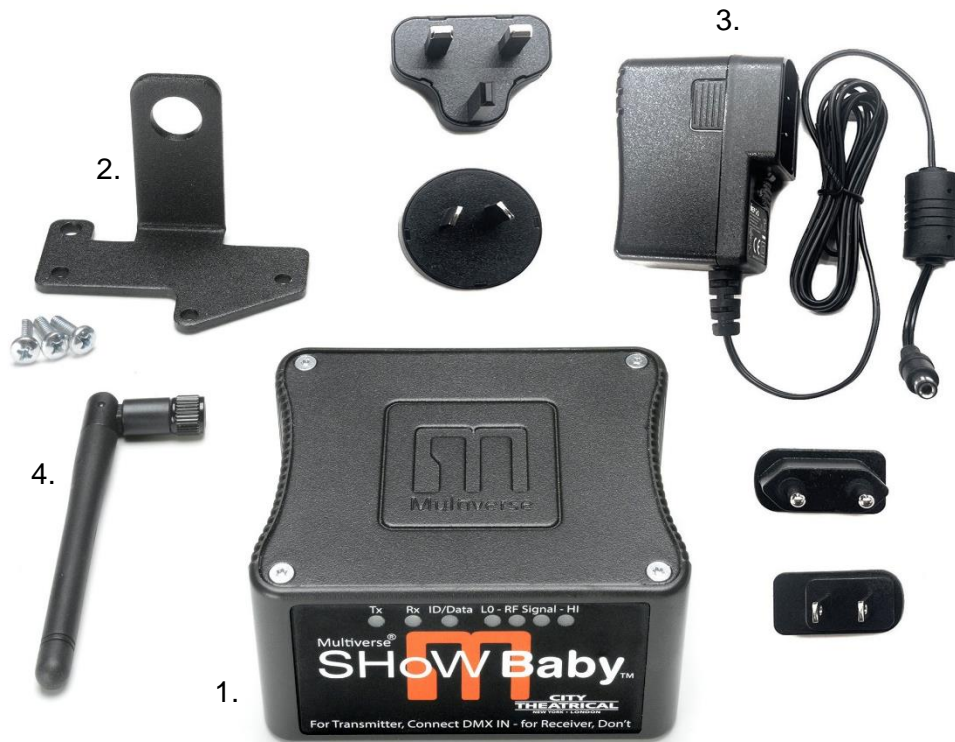
Figure 3: What's Included